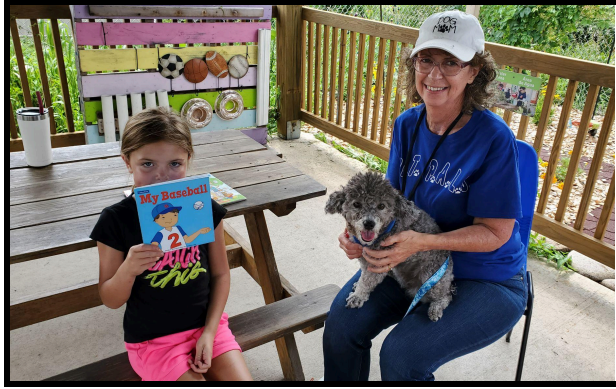
Reading Pals- Children read to pets to practice their fluency and expression during Reading Pals.