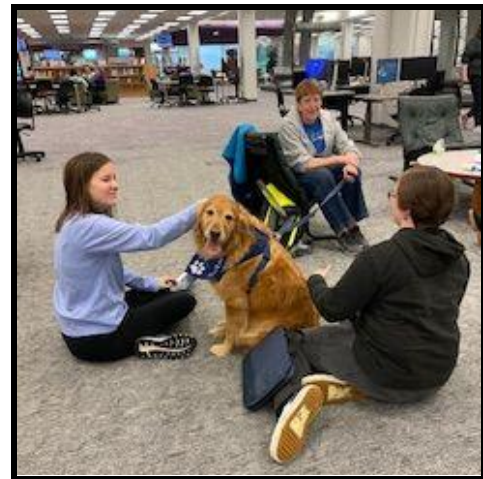
Once again, we went to UNI to help the students "de-stress" during their final exams during the Spring Semester 2024. Our pets love all the attention and petting they get! It's always a fun time!