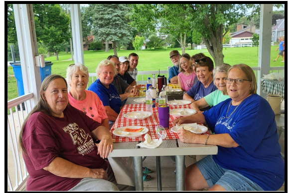
P.E.T. P.A.L.S. picnic- Great food and friends made for a fun P.E.T. P.A.L.S. picnic.