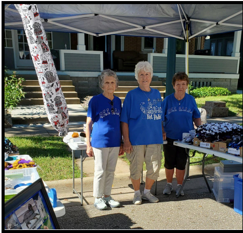
Sturgis Falls-Volunteers greeted customers at our booth during the Sturgis Falls celebration.